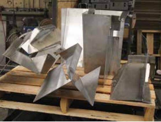
Above: Fabricated sheet metal parts at Wright Steel & Machine.