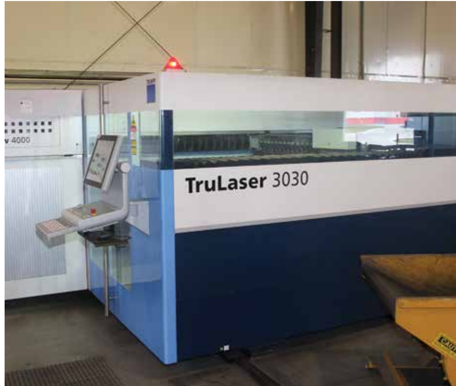
Above: A Trumpf TruLaser laser cutting system at Wright Steel & Machine.

strive to maintain as they grow into the future.