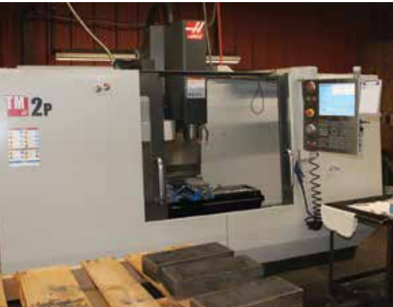
Above: A Haas TM-2P Toolroom Mill at Wright Steel & Machine.